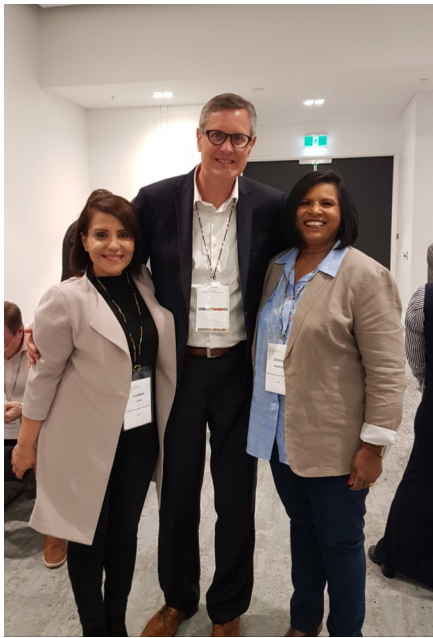
Metropolis Conference 2018