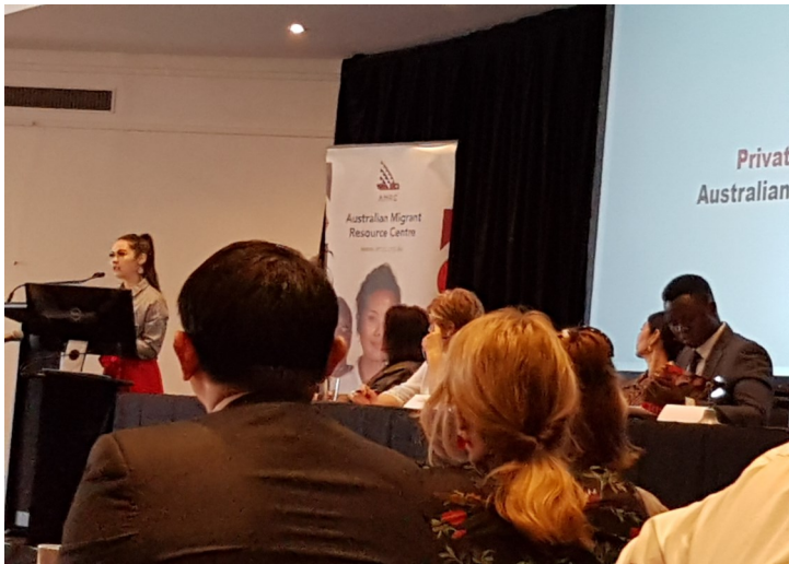
Youth Symposium 2018