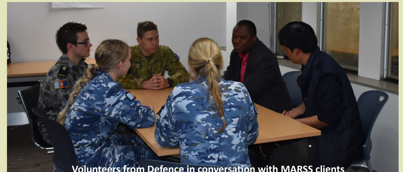
Volunteers from Defence in conversation with MARSS clients