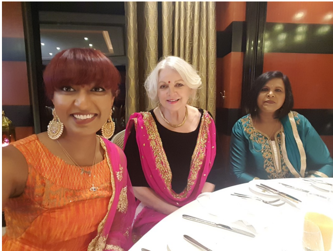
Diwali Celebrations 2018