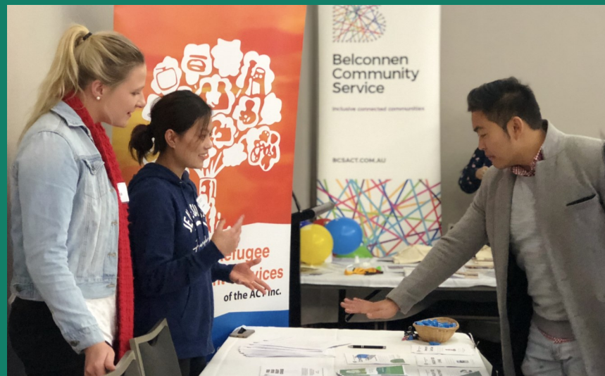
MARSS Staff promoting our services at the ACT Multicultural Women's Expo

The program also holds life skill sessions to new and emerging communities throughout the year. In the last six months we have had sessions on Domestic Violence, Centrelink Services, Employment, ACTSmart Home Emergency Efficiency and Parenting.