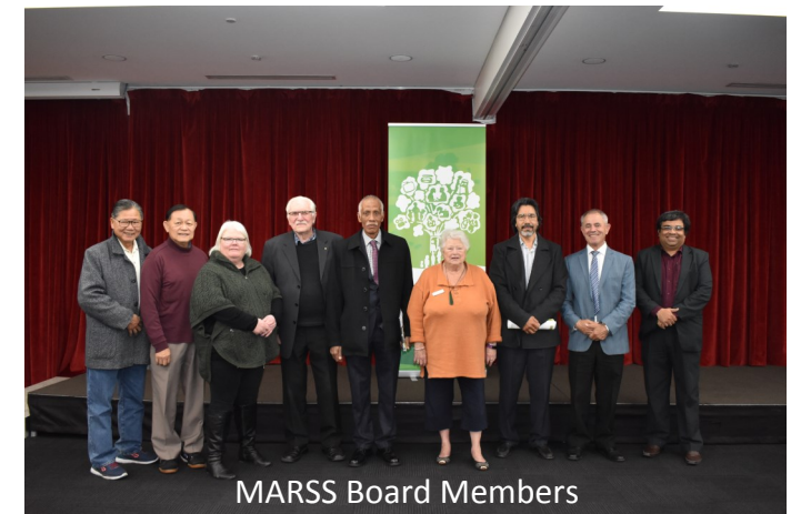
MARSS Board Members