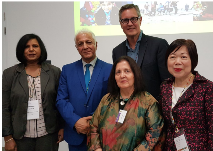
Metropolis Conference 2018