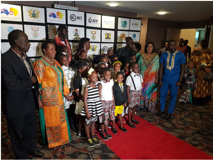
African Awards Dinner 2018