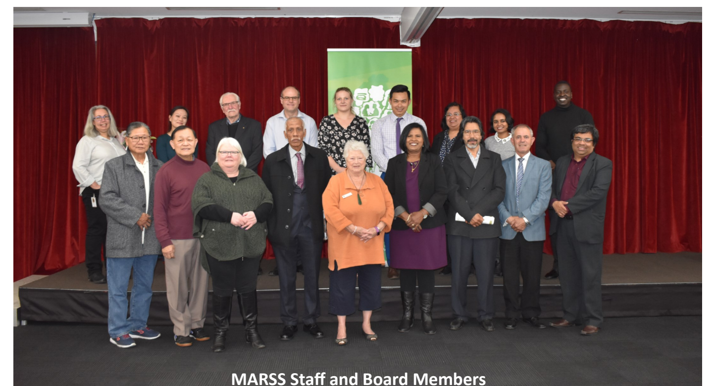
MARSS Staff and Board Members