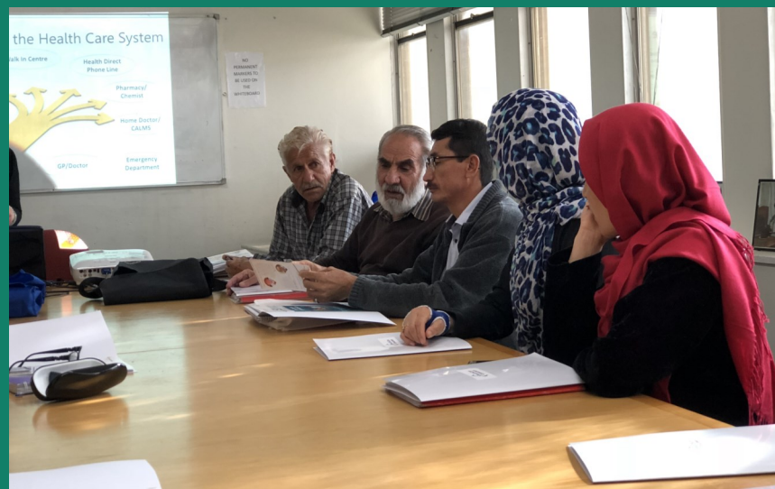
SGP Clients attending a ACT Health Services Information Session