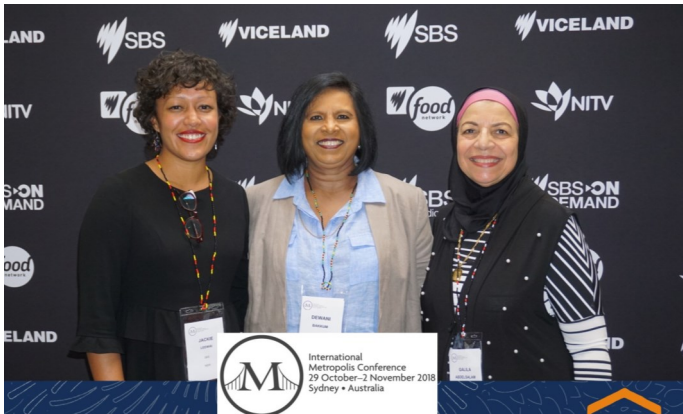
Metropolis Conference 2018